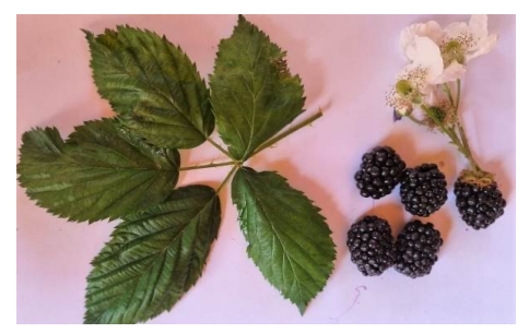
Figure 1. Rubus robustus C. Presl collected from the Chilina Valley

Mature wild blackberries were collected from adult wild plants in the Chilina Valley in the spring (between September and October) as shown in Figure 1. Gathering was carried out by direct hand harvesting of the fully ripe fruits and they were selected by uniformity of size and color and stored in polyethylene terephthalate (PET) containers. Fruit samples were sent to the Proyecto Mercurio Laboratory, where they were carefully washed with deionized water and kept refrigerated at 4 \pm 1 °C. Later, the samples were blended and filtrated to eliminate any solid material before being freeze-stored. Afterwards, the samples were lyophilized in a FreeZone 2.5 Liter Benchtop Freeze Dry System at the Universidad Nacional San Agustin of Arequipa. Finally, the lyophilized samples were placed in PET containers and stored in an environment free of humidity and protected from direct light. A sample of the adult plant and fruit were sent to the Herbarium Areqvipense at the Universidad Nacional San Agustin of Arequipa, which identified it as Rubus robustus C. Presl.