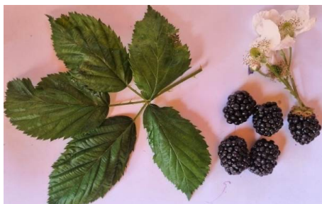
Figure 1. Rubus robustus C. Presl collected from the Chilina Valley

Mature wild blackberries were collected from adult wild plants in the Chilina Valley in the spring (between September and October) as shown in Figure 1. Gathering was carried out by direct hand harvesting of the fully ripe fruits and they were selected by uniformity of size and color and stored in polyethylene terephthalate (PET) containers. Fruit samples were sent to the Proyecto Mercurio Laboratory, where they were carefully washed with deionized water and kept refrigerated at 4 \pm 1 °C. Later, the samples were blended and filtrated to eliminate any solid material before being freeze-stored. Afterwards, the samples were lyophilized in a FreeZone 2.5 Liter Benchtop Freeze Dry System at the Universidad Nacional San Agustín of Arequipa. Finally, the lyophilized samples were placed in PET containers and stored in an environment free of humidity and protected from direct light. A sample of the adult plant and fruit were sent to the Herbarium Arequipense at the Universidad Nacional San Agustín of Arequipa, which identified it as Rubus robustus C. Presl.